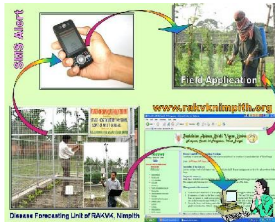
Figure 2: Process of SMS alert system on plant protection advisory through use of cell phone