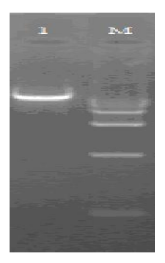
FIGURE 1 : Agarose gel electrophoretogram of plasmid DNA purified from strain Pseudomonas putida . M, Marker DL15000; 1, the plasmid DNA of strain Pseudomonas putida .

The plasmid extraction method, previously described, was used to extract the plasmid encoding the benzene degrading gene (s) from strain Pseudomonas putida . The size of the plasmids were estimated on the basis of electrophoretic mobility of the isolated fragments as compared to the sizes of Promega supercoiled marker, its molecular weight which was found in the range of \sim 5 kb Figure 1.