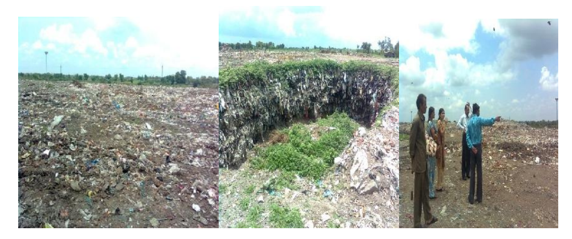
FIGURE 1. Sukali landfill and compost depot

which is situated outskirt of the Amravati city near village Sukali. An aerial photo and a zoomed sampling area are shown in (fig.1). This site is surrounded by a various forms. Three points on the location of the waste dump site was selected and three pits of 20-50 cm depth were dug for soil sampling on selected points.