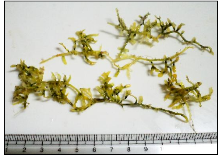
FIGURE 2: Caulerpa racemosa var. Lamourouxii (Turner) Weber-van Bosse

Caulerpa racemosa var. lamourouxii plants are female parents of C. lentillifera based on their spherical ramular morphology resembling eggs, while C. sertularioides represents the male parent with its slender, needle-like ramuli suggesting male copulatory structures (Belleza & Liao 2007) (Fig.2).