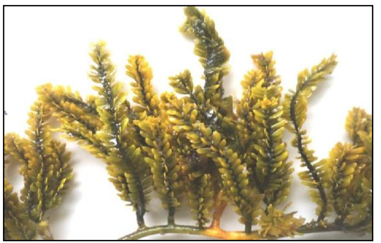
FIGURE 3: Caulerpa mexicana var. pluriseriata W.R. Taylor

Taylor (1975) describes two-ranked, three-ranked and multi-ranked branching in Caulerpa species may only be