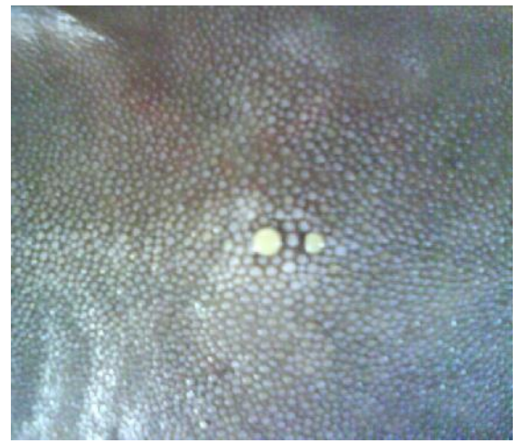
FIGURE 1. Stingray skin with denticles

Unlike many fish skins, the stingrays have denticles instead of scales. The stingray skin is calcified during the mature stage (Dean et al., 2005), becoming very hard and tough and hence the skins are not generally consumed as food. The photographic picture of stingray skin with denticles is presented in Figure 1. Denticles are scattered in two distinct sizes with smaller denticles intermingled between larger denticles. The scanning electron microscope (SEM) image of stingray denticle is presented in Figure 2.