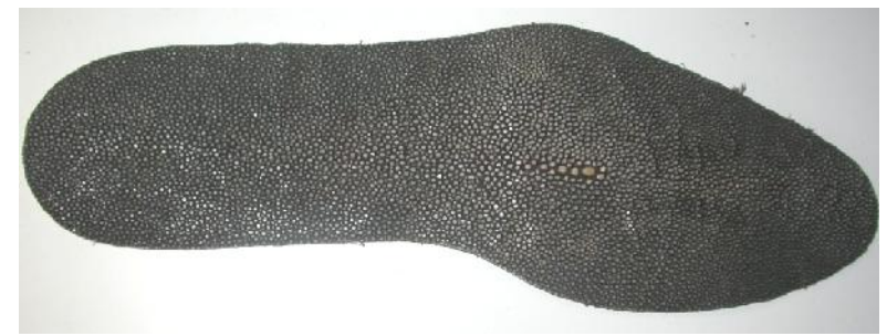
FIGURE 3. Insole from stingray leather