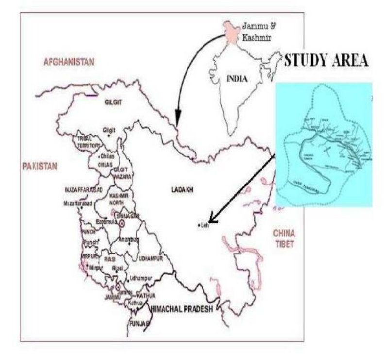
FIGURE 1: Map of study area

The ladakh region (Figure 1), one of the most elevated (2900m to 5900m asl) and coldest region (-30^{\circ}C \text{ to } -70^{\circ}C) of the earth. It covers more than 70,000 square Km geographical area of Jammu and Kashmir, India and lies between 31° 44' 57'' to 32° 59' 57" N latitude and 76° 46' 29" to 80<sup>°</sup> 41' 34" E longitude. Its eastern and western borders form the line of actual control (LAC) between India and China and line of control (LOC) between India and Pakistan, respectively (Fig. 1). Weather data of Leh district were collected for 2000-2013 from Defence Institute of High Altitude Research (DIHAR), Leh and State statistical department, Leh- Ladakh, J&K. These weather data are mainly of temperature (°C) (minimum and maximum), relative humidity RH (%), and precipitation (mm). Analysis of weather data and acreage data were carried out in MS excel 2007. The survey was conducted via questionnaires and interviews with elderly people regarding the past and present status of crop and vegetables growing, in Leh district of Jammu and Kashmir.