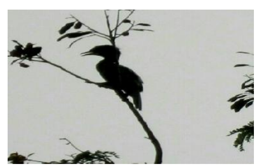
FIGURE 4: Black-crowned night Heron-Nycticorax nycticorax FIGURE 5: Little Cormorants-Phalacrocorax niger

Nest buiding sites are observed in close proximity. The area is covered by different types of trees, but main trees are mango, eucalyptus, Indian fig, coconut and jack fruit.