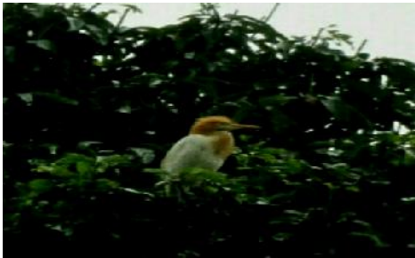
FIGURE 3: Cattle Egret-Bubulcus coromandus