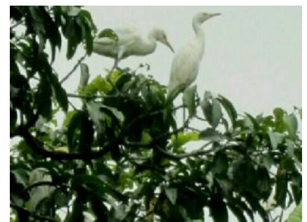
FIGURE 1: Little Egret-Egretta garzetta