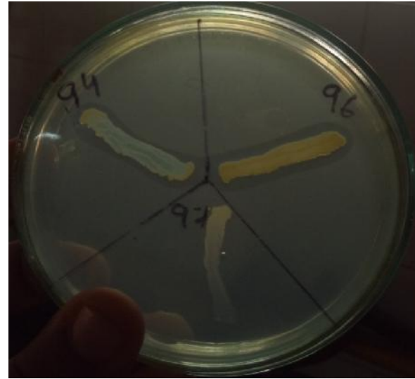
FIGURE 4: Results Given by Isolates on Heated Plasma Agar Plate