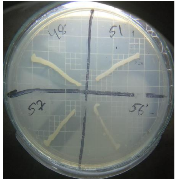
FIGURE 2: Results given by isolates on Casein Agar Plate

The colonies which were able to ferment mannitol and showed yellow color were probably assumed as Staphylococcus spp. (fig. 1). S-34(1), 42, 44, 56, 90, 90 (1), 91, 94, 95, 96, 97 were mannitol fermentor, whereas the remaining isolates couldn't ferment mannitol. In recent studies it has been proved that certain strains of Staphylococcus doesn't ferment mannitol, so the mannitol non-fermentor were further confirmed by heated plasma agar assay. The result of MSA is been tabulated (Table 2).