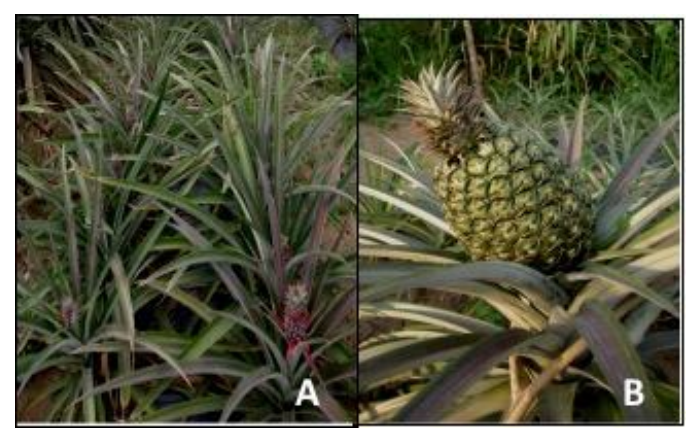
FIGURE 5. Fruiting of field-acclimatized pineapple plants A: fruiting of pineapple plants acclimated to the field; B: mature pineapple fruit.

(1124 g) than FM fruits (996 g) and FR fruits (832 g). Similarly, the length and diameter of the three types of fruit evolved in parallel with the weight of the fruit. In addition, 65 % of FE fruits had significantly a higher commercial interest compared to FM fruits (53.70 %) and FR fruits (43 %). However, the results revealed no significant difference between the central cylinders (heart) of the three types of fruit. The results showed that the vitroplants had developed fruits with physical characteristics significantly higher than those of the traditional plants.