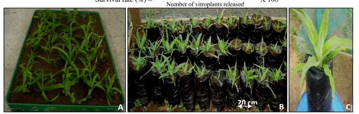
FIGURE 1 . Acclimatization of pineapple vitro plants. A: Vitro plants removed from in vitro culture media and transferred in bins; B: plantlets transferred in polyethylene bags under shade; C: acclimatized plant, ready to be transferred to the field

Survival rate (%) = \frac{\text{Number of vitroplants acclimated}}{\text{Number of vitroplants acclimated}} \times 100