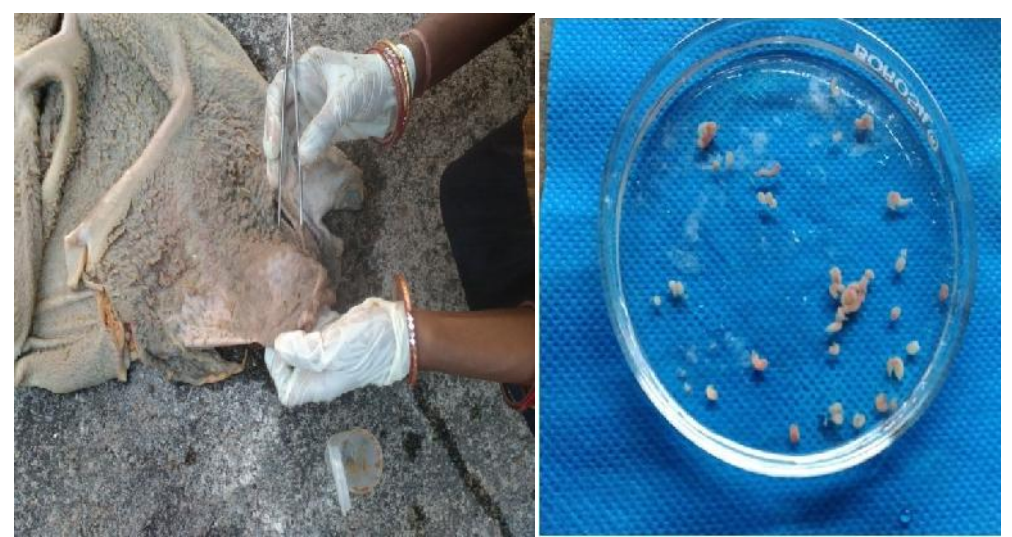
FIGURE 1, 2: Recovery of fluke from postmortem examination