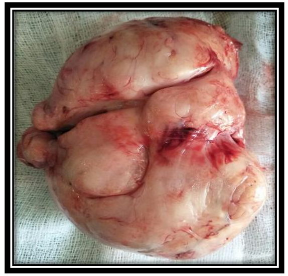
Excised tumourous mass