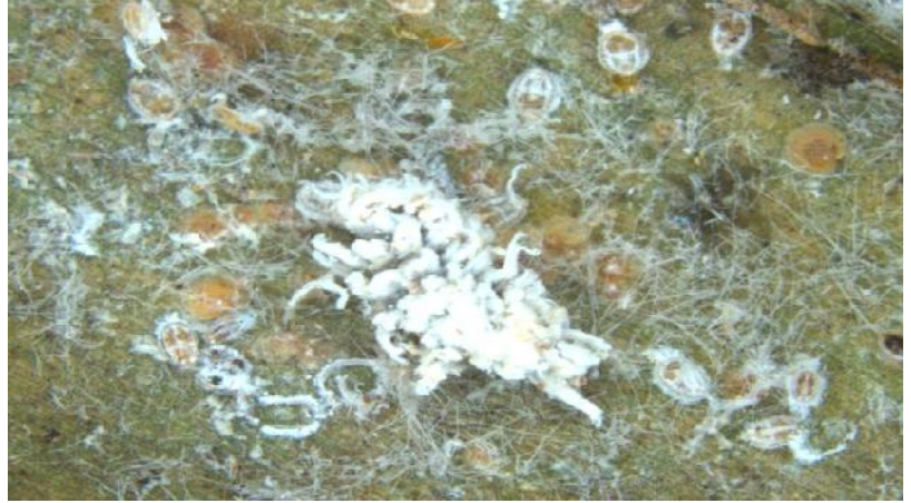
a. Lady bird beetle, C. montrouzieri (IV instar grub) feeding on RSW nymphs