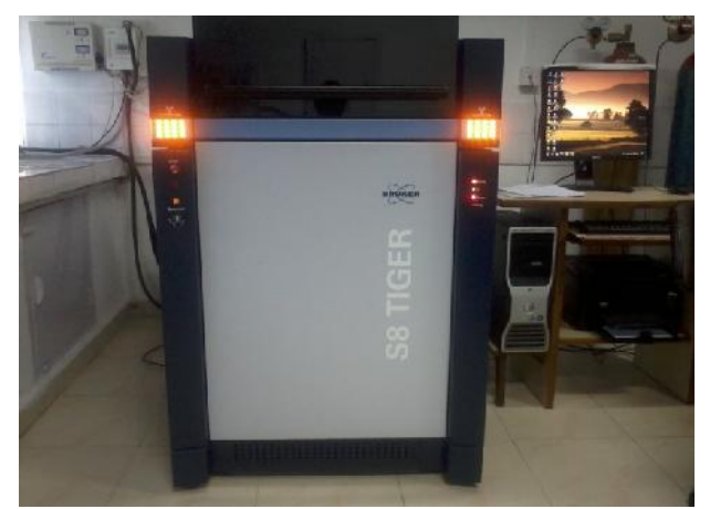
Figure 1: Picture of WDXRF setup located at Panjab University Chandigarh

The system offers the most flexible and compact beam path. In combination with the high performance X-ray tube and advanced analyzer crystals, this compact beam path gives highest intensity and analytical speed.