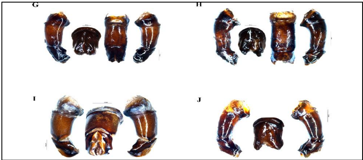
FIGURE-II: G. Liatongus (Liatongus) gagatinus (Hope), H. Liatongus (Liatongus) phanaeoides (Westwood), I. Liatongus (Liatongus) vertagus (Fabricius), J. Liatongus (Paraliationgus) rhadamistus (Fabricius).