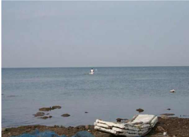
FIGURE 3. Thermocole raft teppam as a craft

ranging from 2 to 3 m width and inner depth around nearly 0.5 m. Apart from being simple and inexpensive, coracle is durable and has very good maneuverability in all types of waters. It is also a versatile craft used for laying and lifting of nets, besides navigation and transport of fish and other materials. This modified version of coracle is cheaper and more durable as the conventional one is made for costly leather.