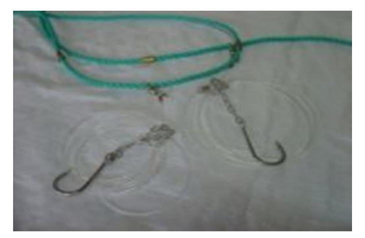
FIGURE 8. Hooks and lines

Hooks and lines were observed to be used throughout the entire stretch of river Kollidam (Fig. 8). This type of fishing technique is used as a deep pool of 6-8 m, in and around the river and also mainly used for stillwater nature (higher water level and less flow). Using earthworm as live bait and snail-flesh as dead bait, this net is also used to collect small sized fingerlings of all type of fish species from the river.