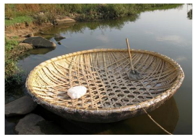
FIGURE 2. Coracle, as a major fishing craft

Coracle is a saucer shaped country craft, locally called 'thoni' is one of the major fishing craft used for catching fishes in Lower Anicut. It's prepared by wrapping HDPP sheet over the split bamboo frame with the help of coal tar as an external covering (Fig. 2). Internal diameter varied