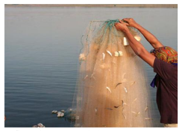
FIGURE 6. Gill net-main fishing gear at Lower Anicut

Gill net is a common fishing net used by commercial and artisanal fishermen of all the freshwater and estuary areas. It is a vertical panel of netting normally set in a straight line. Fishes may be caught by gill nets in 3 ways: (1) wedged – held by the mesh around the body (2) gilled – held by mesh slipping behind the opercula, or (3) tangled –