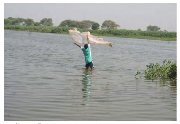
FIGURE 5. Cast net-a major fishing gear in Lower Anicut

Cast nets, also called 'throw net' (in tamil veechu valai) are used as a major gear in Lower Anicut. It is a circular net with small weights distributed around its edge. Cast nets are falling gear, conical in shape with lead sunken or weights attached at regular intervals on the lead rope forming the circumference of the cone (Fig. 5). It is made up of either cotton or nylon thread. Cast or thrown by hand in such a manner that it spreads out on the water