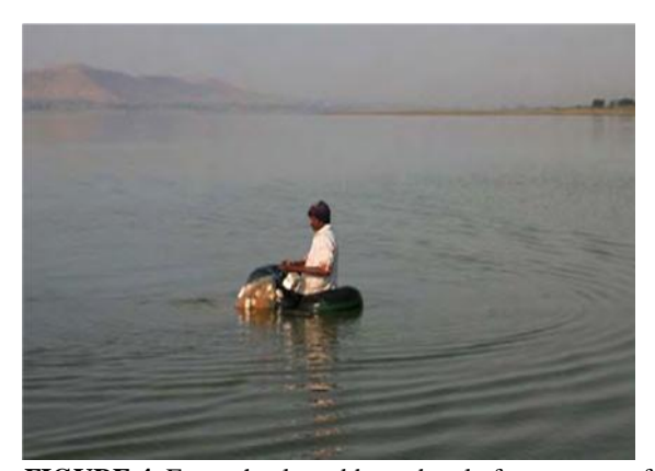
FIGURE 4. Four wheeler rubber tube platform-as a craft

In the river Kollidam, the fishermen were observed to rely on another kind of improvised materials. It showed considerable ingenuity in fabricating makeshift crafts out of discarded old rubber tubes. A wooden platform (~1 sq m in area) is placed over the rubber tube and tied tightly with nylon rope. It is mostly used for hook and line operation and also setting and hauling of gill nets (Fig. 4).