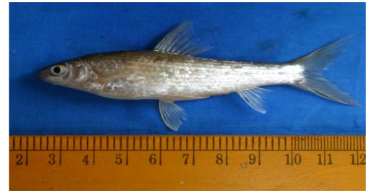
FIGURE 10. Cirrhinus reba (Hamilton, 1822)

was 14.4% and gradually reduced to 7.3%, respectively. Among the major catfishes, Mystus aor and Wallago attu increased after the construction of dam and together constituted not less than 35% of the total annual catch in most of the years; thereafter in the year of 1964-65 onwards to 1992-93 it was decreased to less than 10% of total catch. In India, the National Bureau of Fish Genetic Resources from Lucknow and Zoo Outreach Organization has recently evaluated of the 329 fresh water fish species for the purpose of catch composition, taxonomical distribution and identification. Despite the rich biodiversity some of freshwater fish species are even endangered due to various anthropogenic factors (Cairns et al. , 1993).