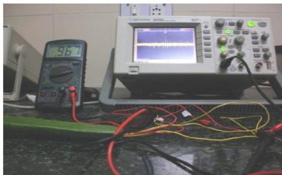
FIGURE 3: Response of Ag-Zn cell using DSO and DMM

Digital Storage Oscilloscope (DSO) as well as Digital Multimeter (DMM) is shown in figure 3.