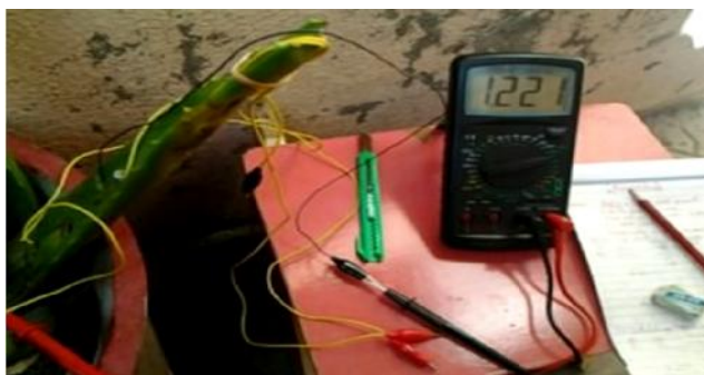
FIGURE 2: Experimental set up and optimum reading.

readings were taken within 50 minutes and thereafter the output became almost stable.