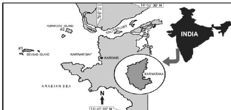
Fig.1. Map showing the location of study sites in the Karwar Bay, Karnataka, West Coast of India

get sunlight attenuation depth. For estimation of different nutrients (phosphate, nitrite and silicate), the standard methods were followed as described by Strickland and Parsons (1975) & APHA (1980).