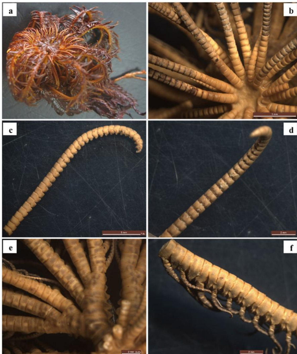
Figure: 2. a- Petasometra clariae (Hartlaub, 1890); b- Centrodorsal with cirris; c- Cirri dorsal view; d- Cirri ventral view; e- Br division series with syzygy; f- Proximal pinnules

Remarks: This is a new record from Andaman Islands and also from Indian waters.