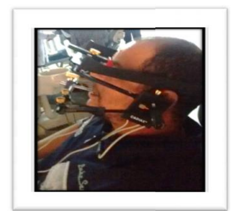
FIGURE 1: Cadíax compact - mounted on patient

All data interpreted in a computerized database structure. "Statistical Package for Social Sciences" (SPSS) version 20 was applied. Comparisons were done using; Two Independent Samples t-test, two independent Mann-Whitney test And Contingency Coefficient (CC), with P value considered statistically significant when < 0.05.