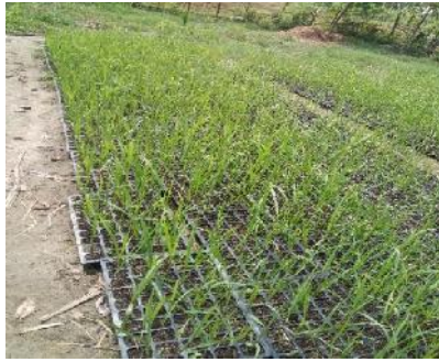
Grown up settlings in protrays on farmer's field