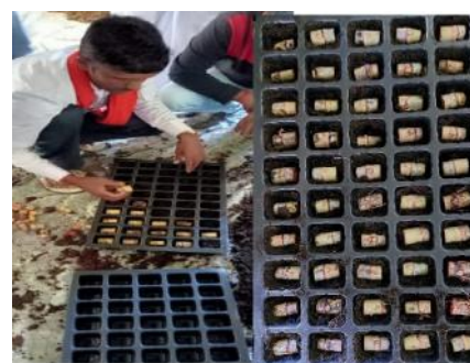
Placement of single bud Setts by farmer