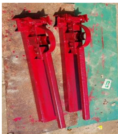
Single bud cutter