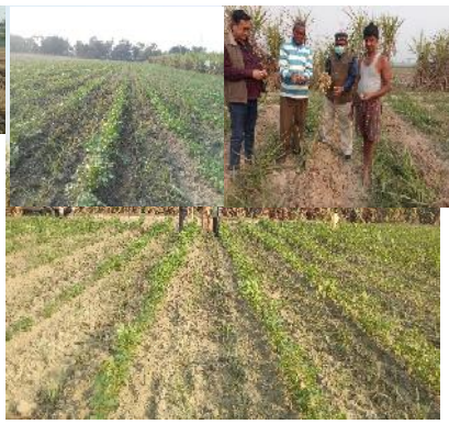
Sugarcane + Potato