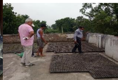
Unpacked trays spread horizontally