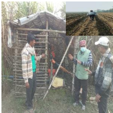
Drip irrigation & fertigation