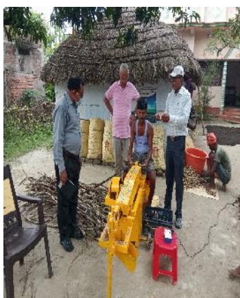
Bud cutting by farmer through single bud cutter