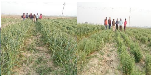
Sugarcane + Wheat