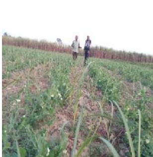
Sugarcane + Field pea