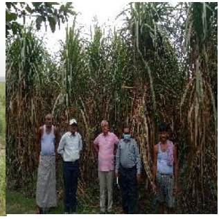
KVK, technocrats and HSM officials with farmer's