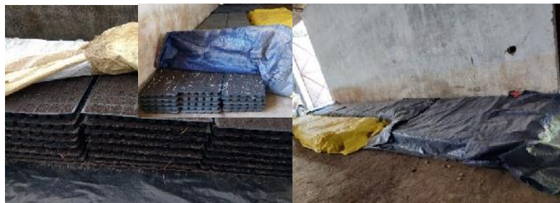
Stacking trays with vertically and covering with polythene sheet