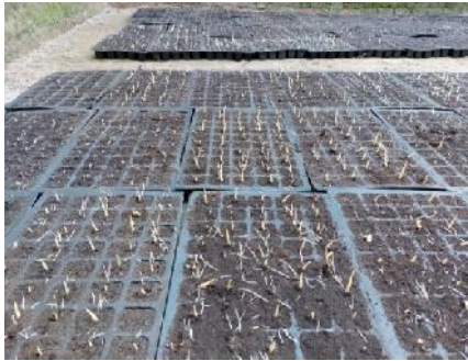
Settling germination started